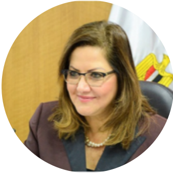
Her Excellency Dr. Hala El Saeed (TBC) Minister of Planning and Economic Development Cairo, Republic of Egypt